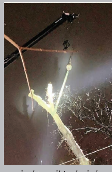
On December 4th in Vernon, we had to call in the help of IP&E Rigging to help remove large trees that had fallen on distribution lines feeding into Pleasant Valley Lake. Attempting to cut these trees would have damaged or broken the wire.