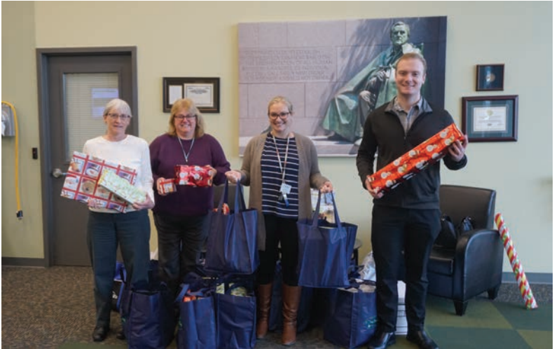
In November we took part in Family Promise of Sussex County's holiday collection drive to benefit children in our community affected by homelessness. Many of our members turned out to offer new toys and winter clothing to help make the holidays in Sussex County a little bit brighter!