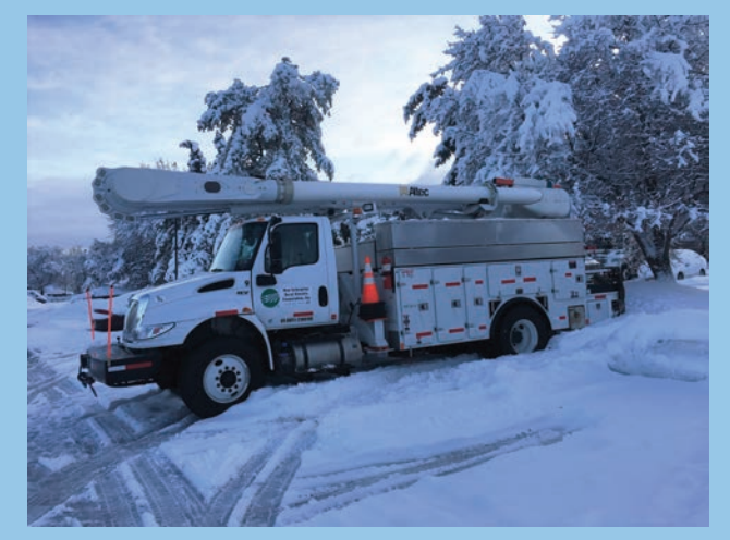
During December's storm, we received aid from our sister co-ops from Pennsylvania. We would like to thank New Enterprise Rural Electric Cooperative, Inc., Adams Electric Cooperative, Inc., REA Energy Cooperative, Inc., Valley Rural Electric Cooperative Inc., and Warren Electric Cooperative, Inc. for all their help.