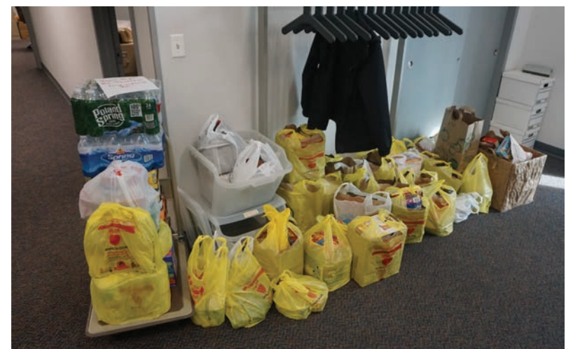
For the holidays, we kicked our Food Drive into overdrive! Our employee food drive resulted in 311 pounds of food being delivered to the Division of Social Services, along with many pounds of food donated by our members. We collect year-round, so we encourage everyone to make a contribution at our office!